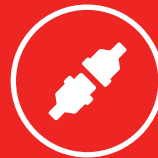
PREVENTS ACCIDENTAL DISCONNECTION