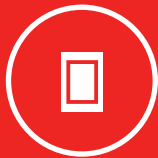
BOTTOM RELEASE LOCKING MECHANISM