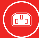
C14 LOCKABLE CONNECTOR